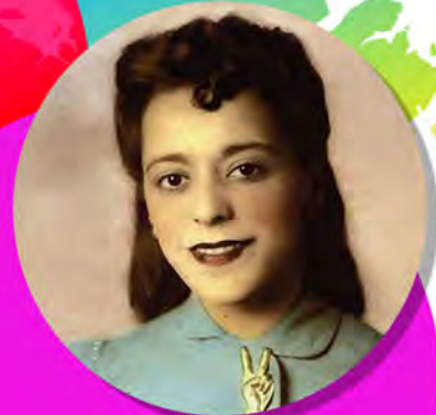
Civil Rights Icon, Viola Desmond