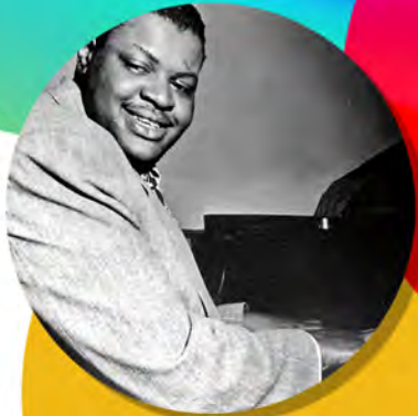
Canadian Jazz Pianist, Oscar Peterson