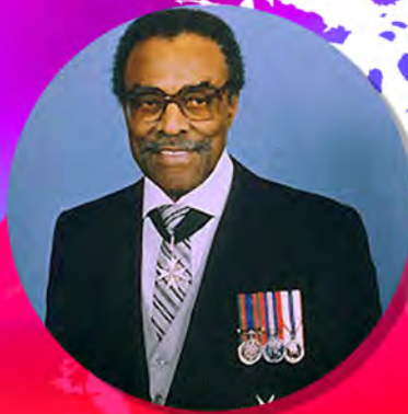
First Black Member of Parliament Lincoln Alexander