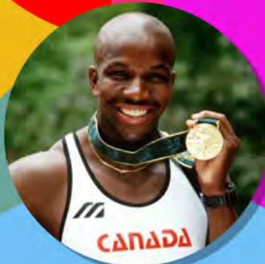
Olympic Gold Medalist, Donovan Bailey